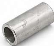
17 ALUMINIUM CONNECTOR