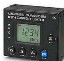
19 AUTOMATIC CHANGEOVER WITH CURRENT LIMITER