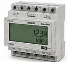
15 FOUR CHANNEL DC ENERGY METER