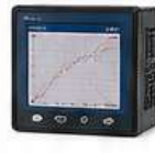
DAQ / PAPERLESS RECORDER