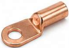
01 CU PIN LUG