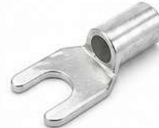
04 AL U LUG