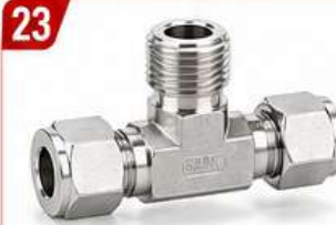
MALE BRANCH TEE ( SINGLE FERRULE)