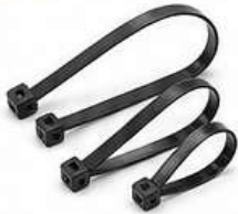
06 CABLE TIE