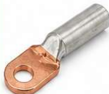
18 BIMETALLIC LUG