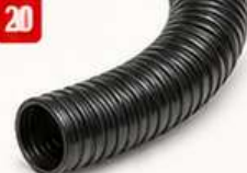
FLEXIBLE CONDUIT PIPE