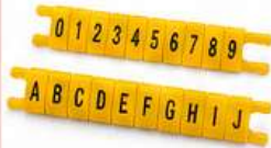
12 WIRE MARKER TAGS