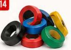
PVC INSULATION TAPE