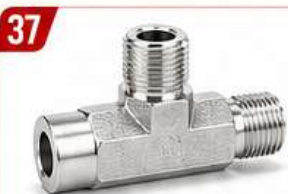
MALE RUN TEE ( PIPE FITTINGS)