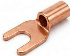
02 CU U LUG