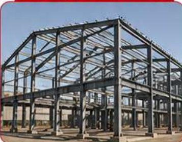
11. GENERAL STRUCTURALS