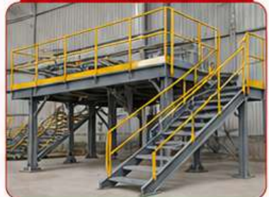
12. HANDRAILS & PLATFORMS