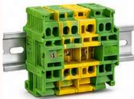
11 EARTH TERMINAL BLOCKS