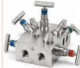
05 MALE CONNECTOR