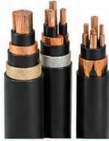
02 POWER CABLE