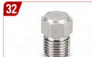
TUBE PLUG ( SINGLE FERRULE)