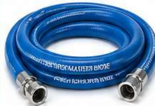
04 TEFLON WITH SS BRAIDED HOSE