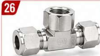
FEMALE RUN TEE ( SINGLE FERRULE)