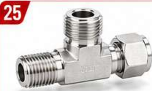
MALE RUN TEE ( SINGLE FERRULE)