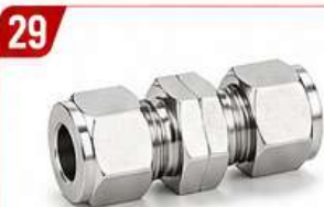
TUBE ADAPTOR ( SINGLE FERRULE)