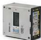
EARTH LEAKAGES RELAY