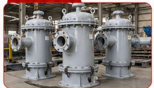
6. FILTER ITEMS