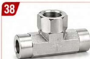
FEMALE RUN TEE ( PIPE FITTINGS)