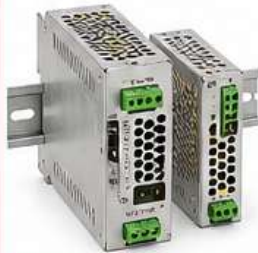
07 SMPS - DINRAIL MOUNT