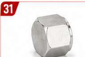
TUBE CAP ( SINGLE FERRULE)