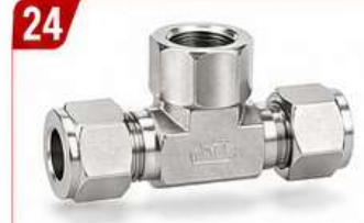
FEMALE BRANCH TEE ( SINGLE FERRULE)