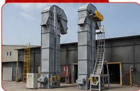
8. BUCKET ELEVATORS