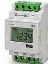
14 SINGLE CHANNEL DC ENERGY METER