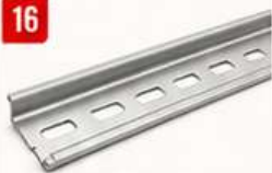
MOUNTING CHANNEL (DIN RAIL)