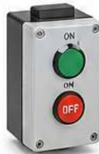
12 BREAKER CONTROL SWITCH