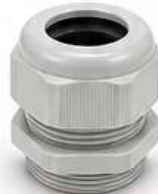
13 NYLON CABLE GLAND