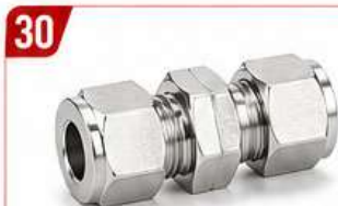
PLAIN CONNECTOR ( SINGLE FERRULE)