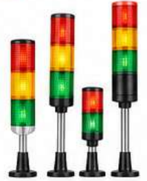
05 TOWER LAMPS