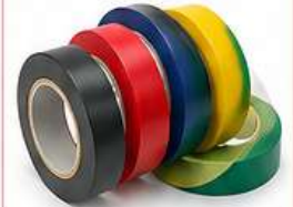
10 PVC INSULATING TAPE