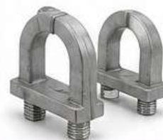
19 CABLE CLEAT