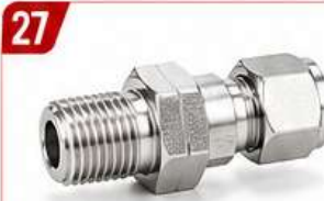
MALE ADAPTOR ( SINGLE FERRULE)