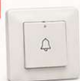
BELL PUSH SWITCH