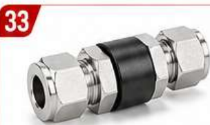
DI-ELECTRIC UNION ( SINGLE FERRULE)