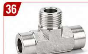
MALE TEE ( PIPE FITTINGS)