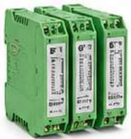
16 TRANSDUCER & ISOLATORS