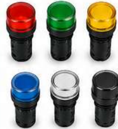
04 INDICATING LAMPS