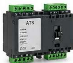
17 AUTOMATIC TRANSFER SWITCH