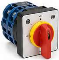
06 ROTARY CAM SWITCH