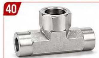
FEMALE BRANCH TEE ( PIPE FITTINGS)