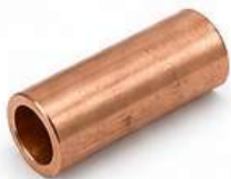
16 COPPER CONNECTOR