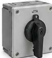
18 MANUAL TRANSFER SWITCH