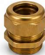
14 BRASS CABLE GLAND