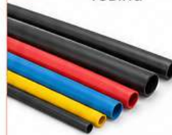
09 HEAT SHRINK TUBING