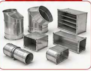
15. DUCTS (ALL TYPES)