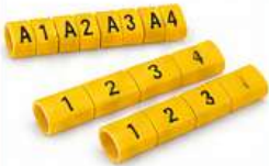
11 CABLE MARKER SLEEVES