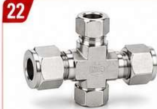
UN EQUAL TEE ( SINGLE FERRULE)