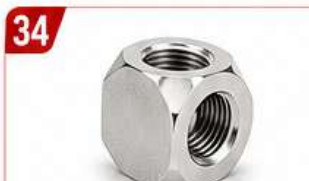
NUT ( SINGLE FERRULE)