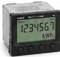
13 COUNTER TYPE ENERGY METER