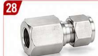
FEMALE ADAPTOR ( SINGLE FERRULE)