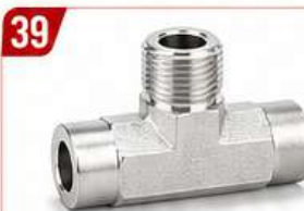
MALE BRANCH TEE ( PIPE FITTINGS)