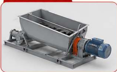
7. INLET FEEDERS