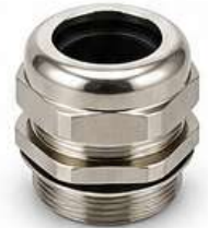
05 CABLE GLAND