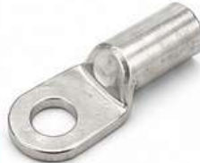
03 AL PIN LUG