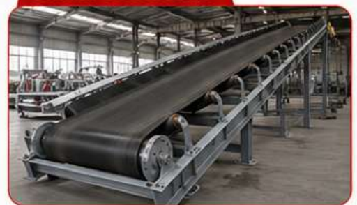
9. BELT CONVEYORS