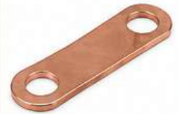
15 EARTHING LUG