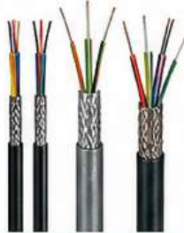
03 SIGNAL CABLE