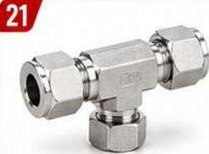
EQUAL TEE ( SINGLE FERRULE)